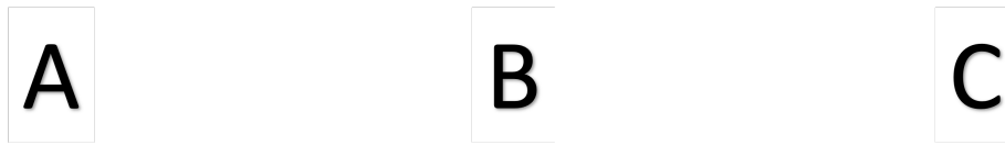
Fig. 3.5: Sub-figure with no captions